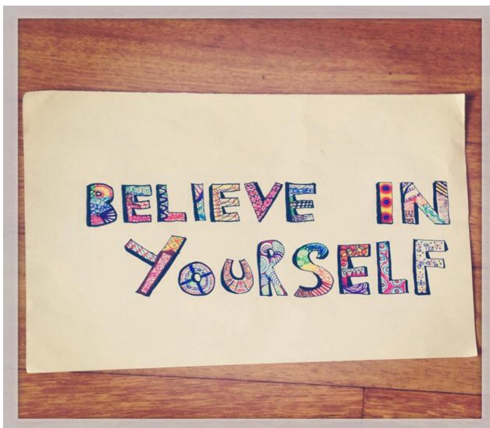
Note to Self!