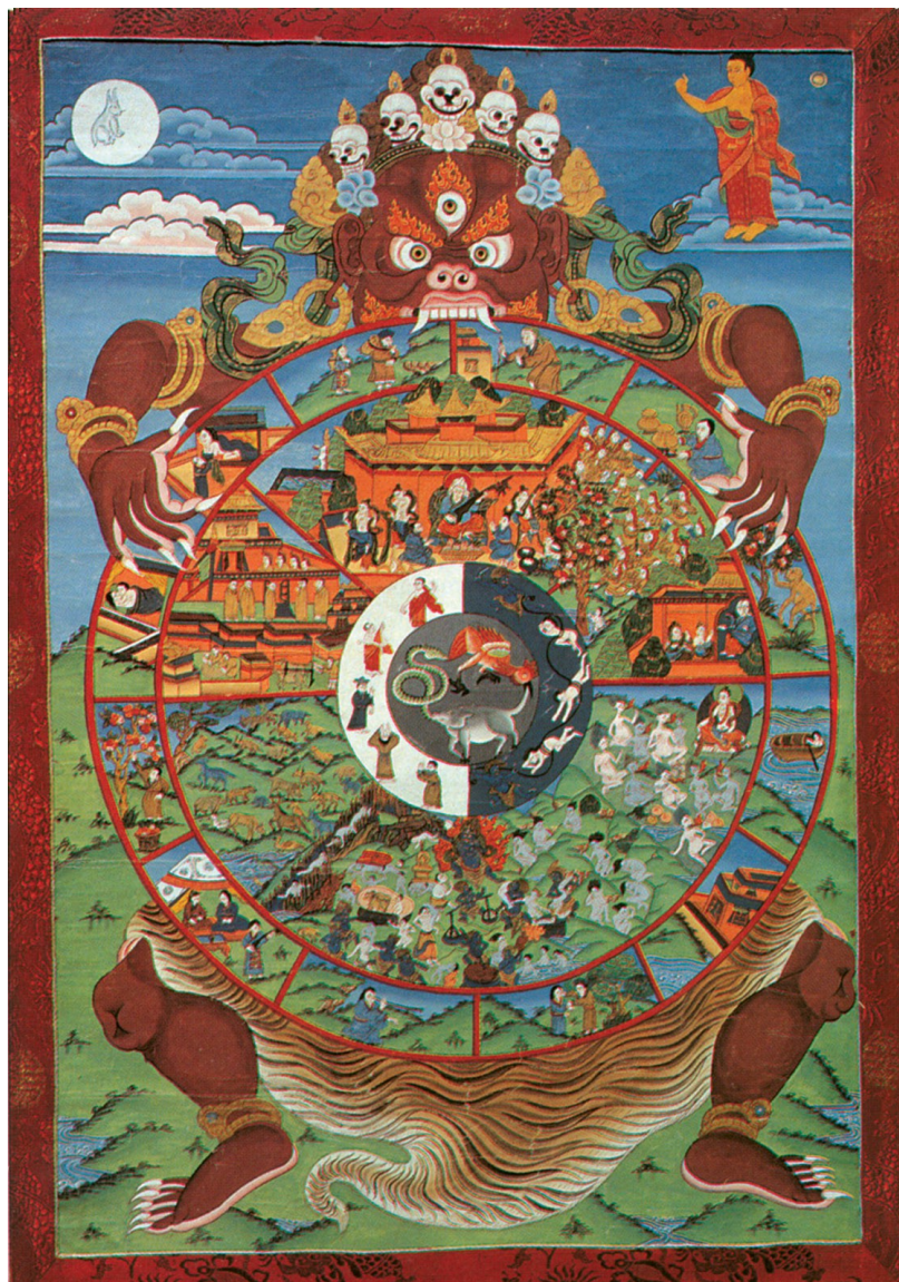
The Buddhist Wheel of Life

Infinite, omnipresent and pure consciousness is how we all started out & this is what we all still are, just still the mind enough to observe it... In-Joy.